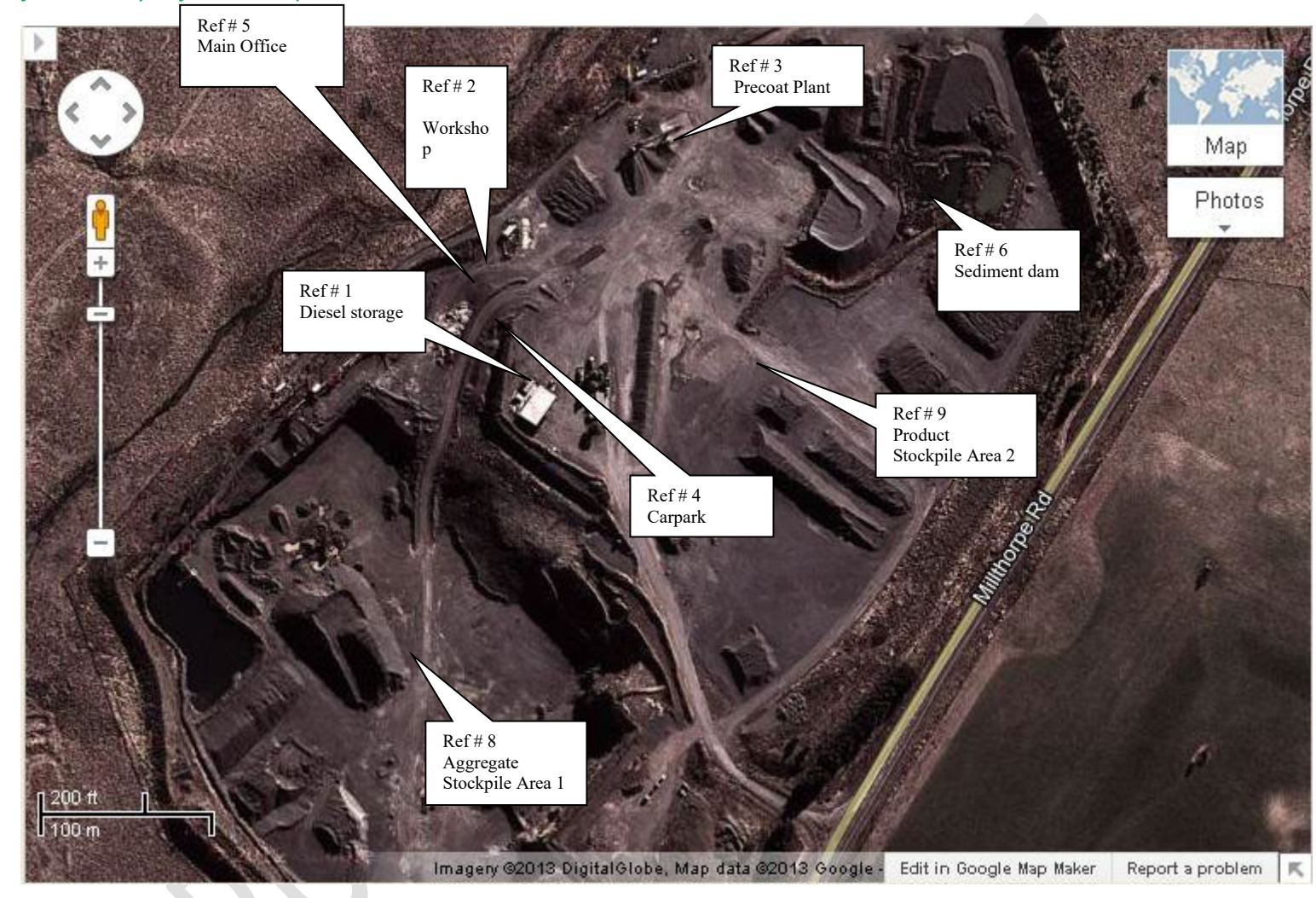
Figure 2 - Shadforth Quarry Reference Map