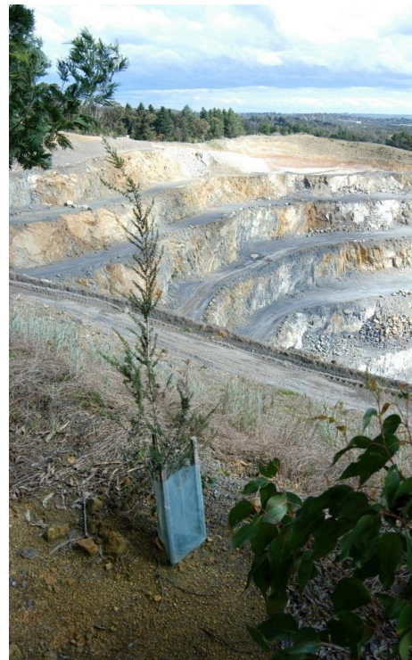
The visual bunds that will be removed and replaced after extraction

It is anticipated that the bench-specific works will begin early September 2016 and will continue into 2017.