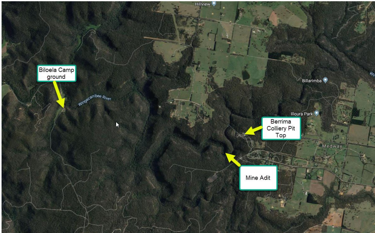
Biloela Campground downstream from mine adit discharge point