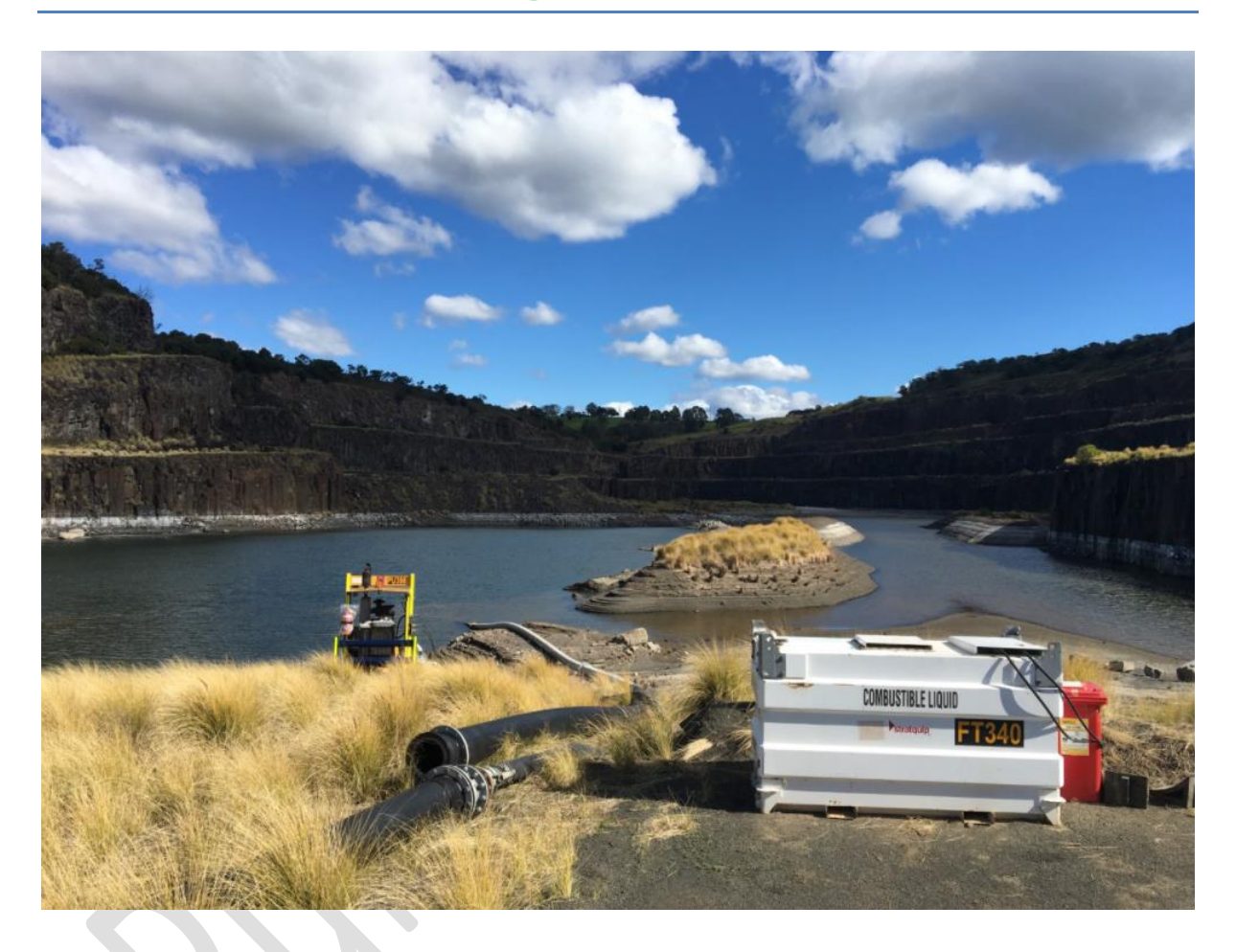
Bombo Quarry EPL313