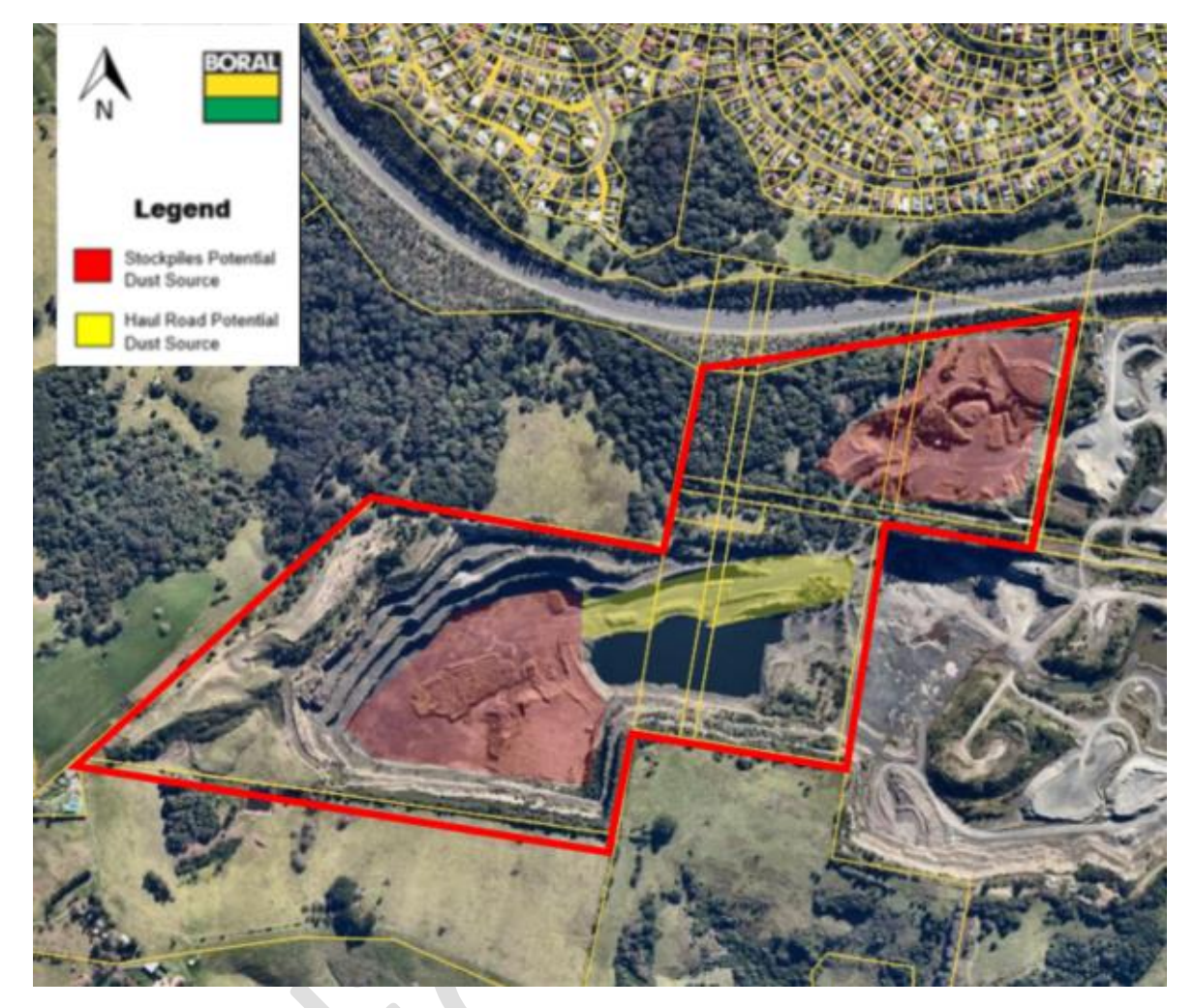
Figure 6: Incident 2: Sources of Dust Pollution at Bombo

Please note that pollution controls include operational response which is not included on these maps. See Table 1 in Section 7 for more detail on pollution controls for Incident ^{\#}2 .