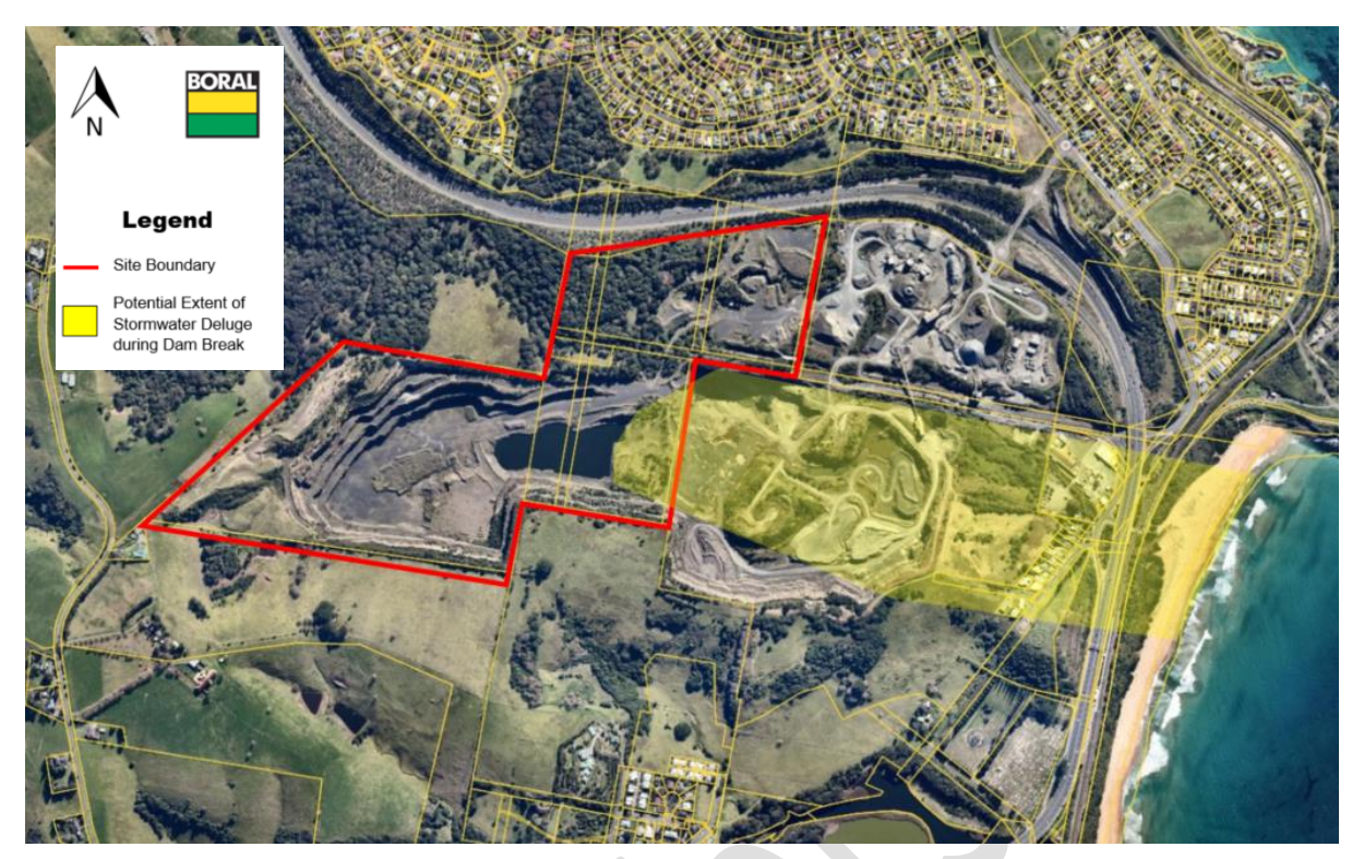
Figure 8: Incident 3: Overflow of Sediment Dams due to Flooding or Dam Failure

Please note that pollution controls include inspections and operational response which are not showed on these maps. See Table 2 in Section 7 for more details.