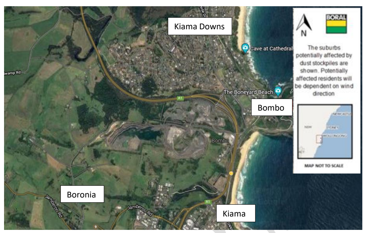
Figure 7: Incident 2: Potential Suburbs Affected by Dust Emissions under Adverse Conditions