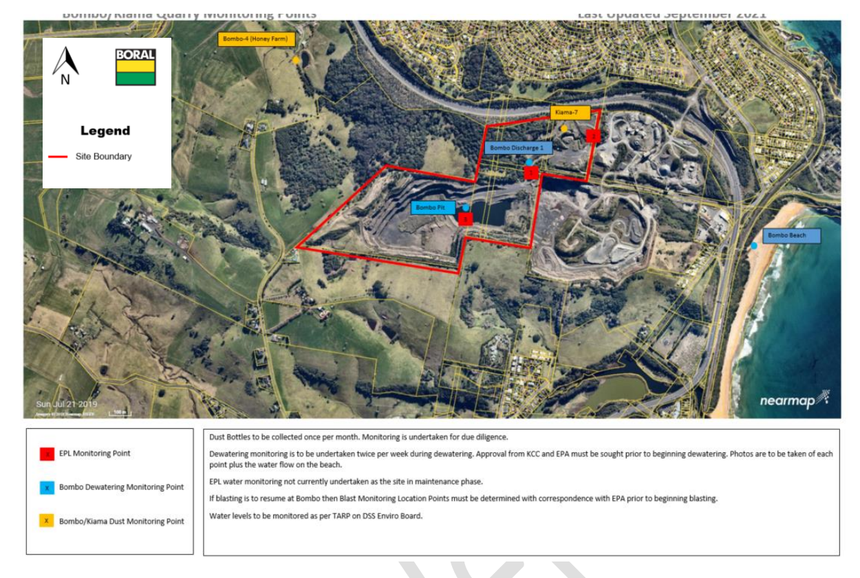
Figure 1 Bombo Quarry Site Layout