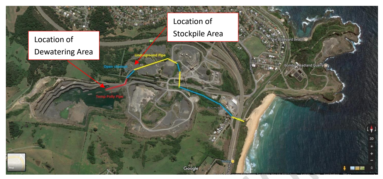
Figure 2 Bombo Operational Areas