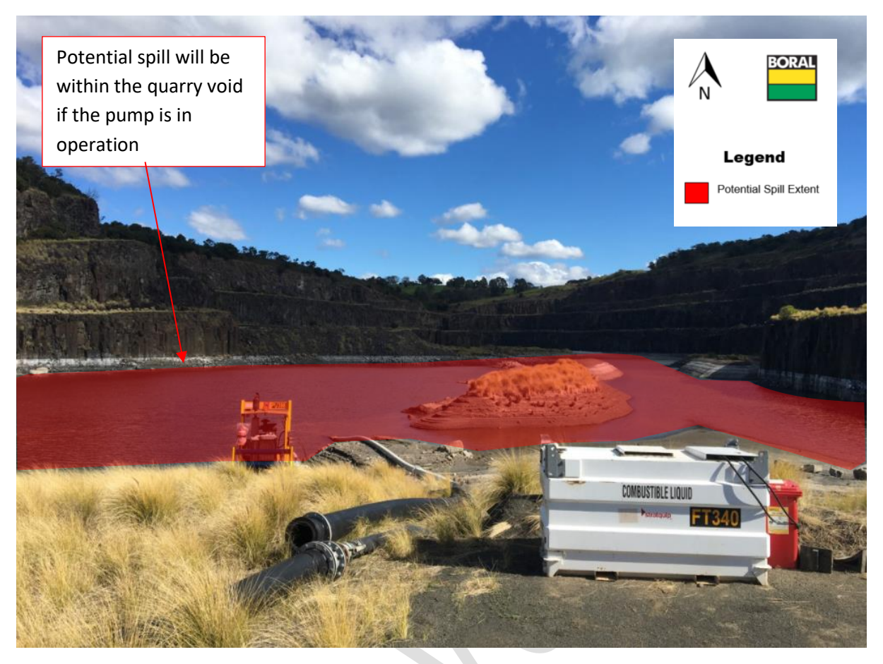
Figure 4: Bombo Dewatering Area Incident 1: Diesel/Hydrocarbon Spill