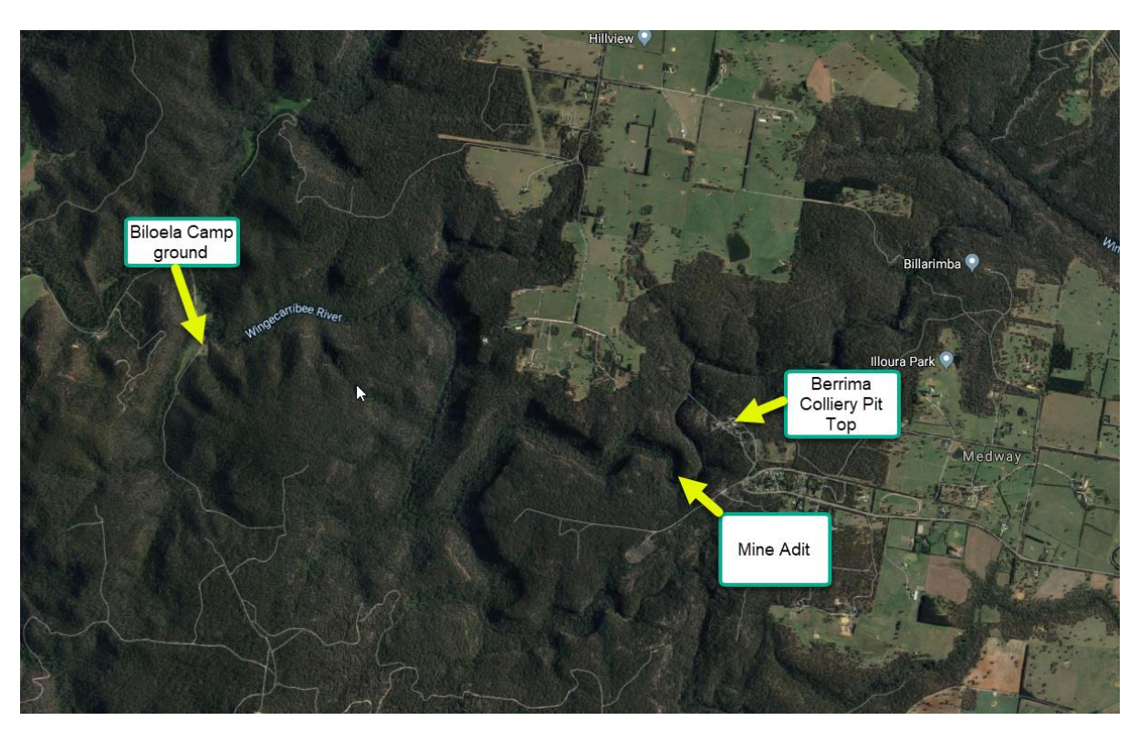
Biloela Campground downstream from mine adit discharge point