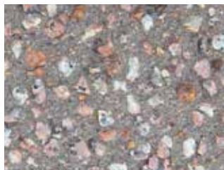
Tableland Pink 7mm