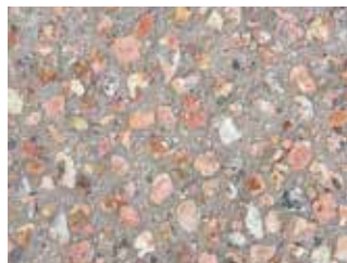
Tableland Pink 10mm