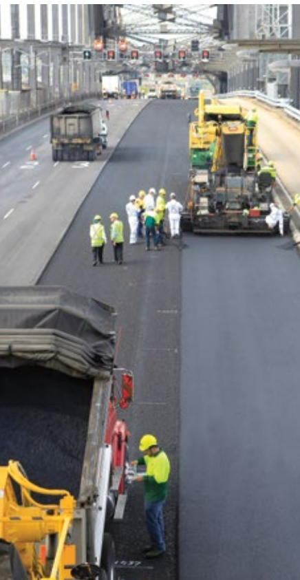
Boral paving asphalt on Sydney Harbour Bridge.

Other Contractors: Sydney Profiling Services, SAMI Road Services, SIKA, Able Traffic Control.