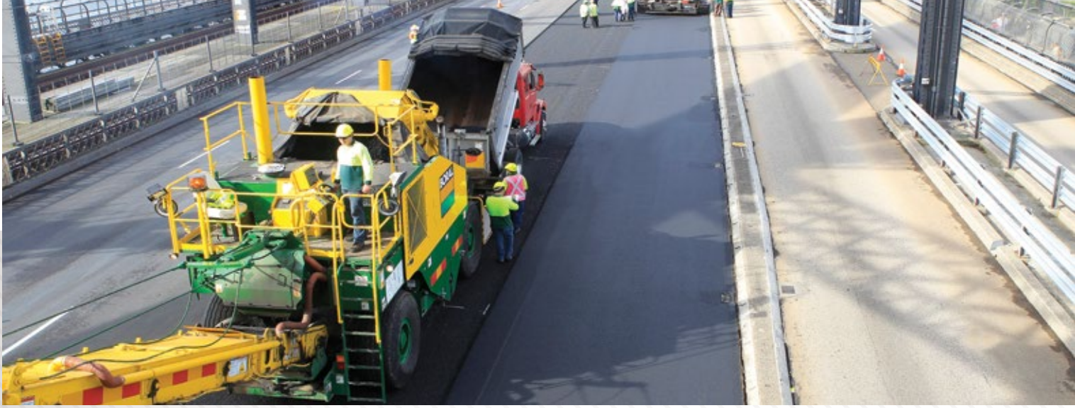
Loading the material transfer device. (MTD)