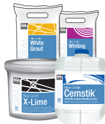
Specialty & Additives