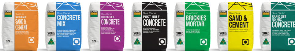
Dry Mix (Just add water)