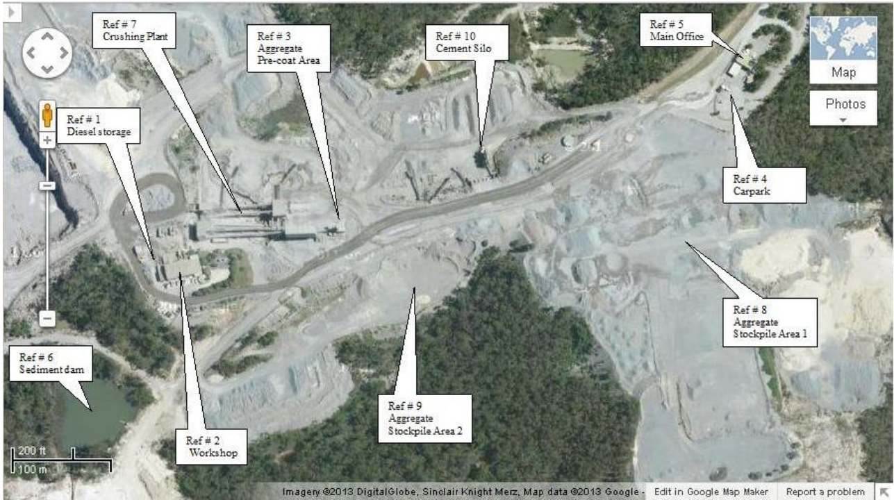
Figure 2: SITE LAYOUT