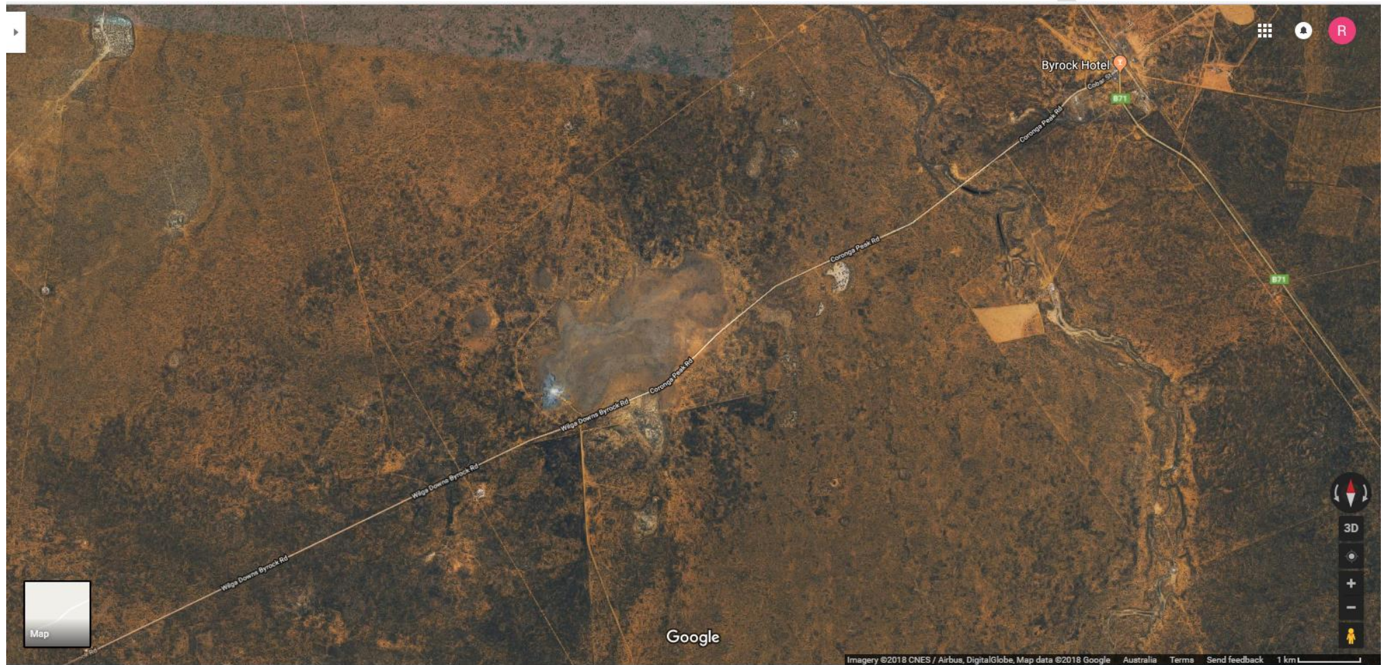
Figure 3 - Byrock Quarry – Map of Affected Areas