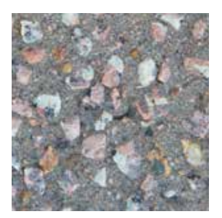
Tableland Pink 7mm