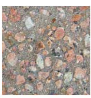
Tableland Pink 10mm