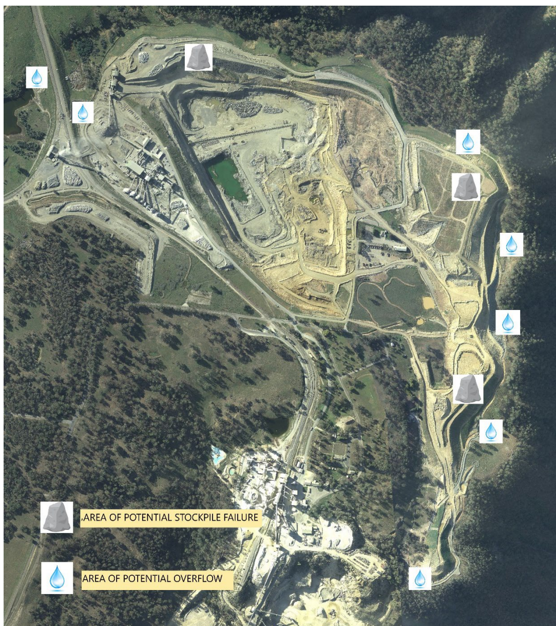
Figure 4: Overflow of Sediment Dams due to Flooding or Dam Failure

Please note that pollution controls include inspections and operational response which are not showed on these maps. See Table 1 in Section 6 for more details.