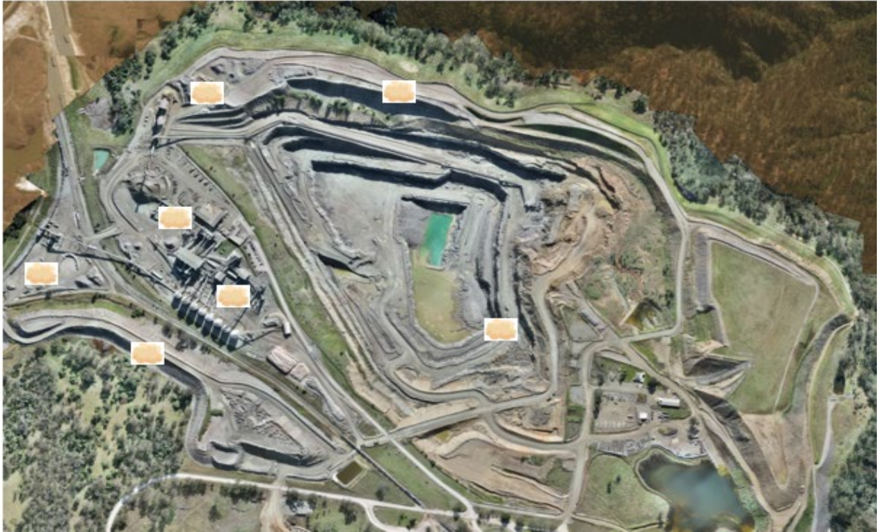
Figure 3: Potential Sources of Dust Pollution at Peppertree Quarry

Please note that pollution controls include operational response which is not included on the map. See Table 1 in Section 6 for more detail on pollution controls for Incident #2.