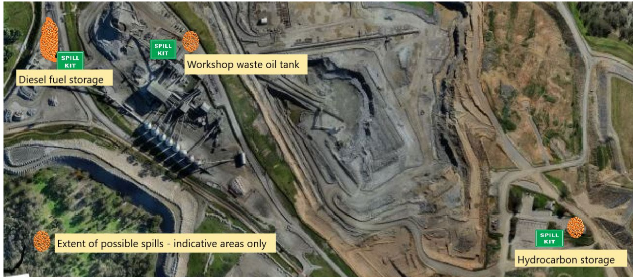
Figure 2: Hydrocarbon Storage Area