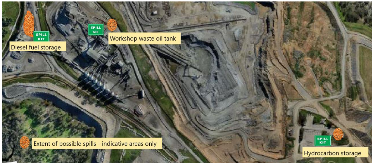
Figure 2: Hydrocarbon Storage Area