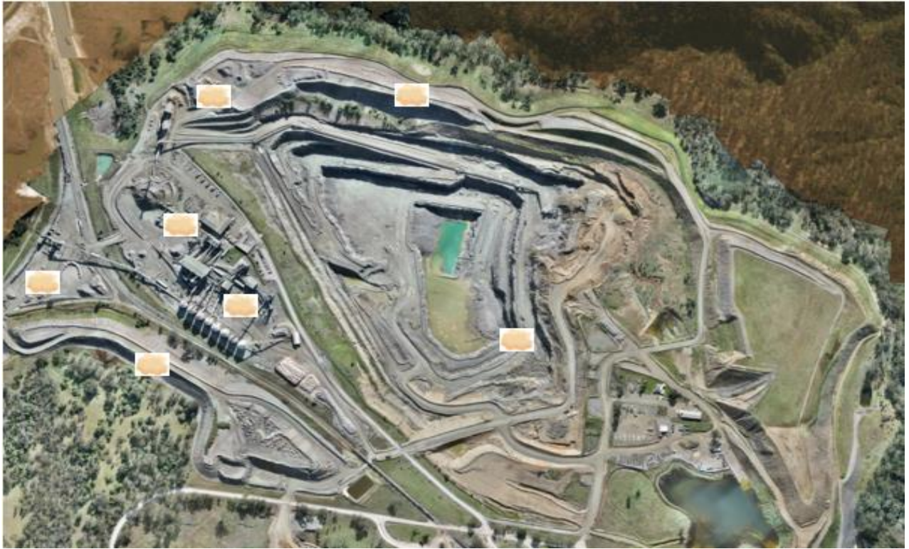
Figure 3: Potential Sources of Dust Pollution at Peppertree Quarry

Please note that pollution controls include operational response which is not included on the map. See Table 1 in Section 6 for more detail on pollution controls for Incident #2.