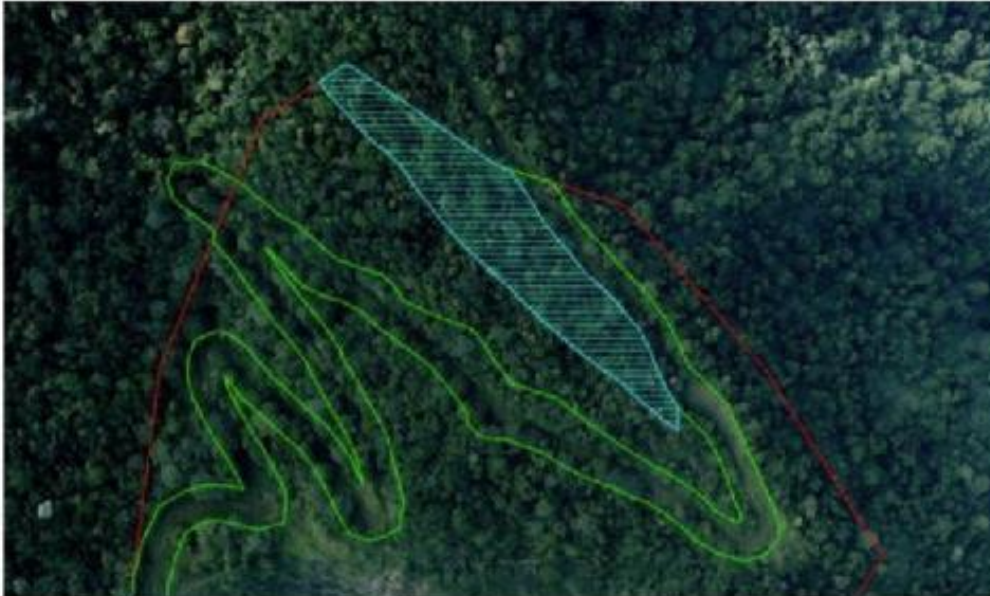
Figure 1: Location and extent of the proposed disturbance area involved in opening up the first three (3) benches in accordance with current planning approvals