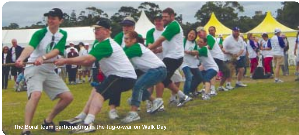
The Boral team participating in the tug-o-war on Walk Day.