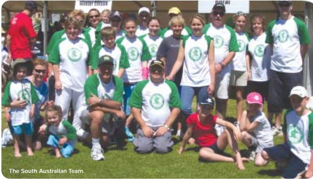
The South Australian Team.