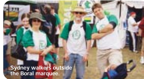
Sydney walkers outside the Boral marquee.