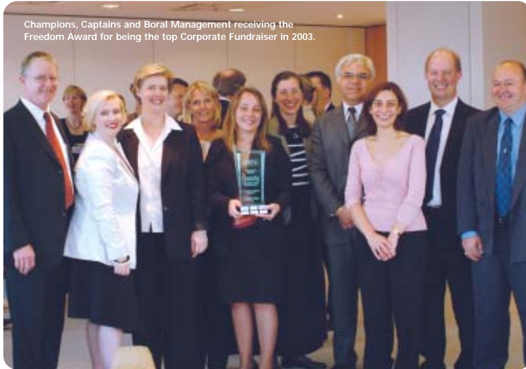
Champions, Captains and Boral Management receiving the Freedom Award for being the top Corporate Fundraiser in 2003.