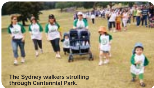
The Sydney walkers strolling through Centennial Park.