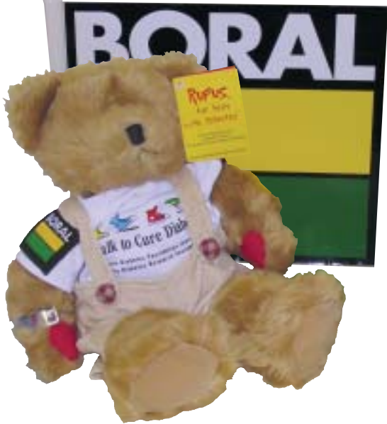
Date: 10.9.2004 Place: Nammoona Mill, NSW