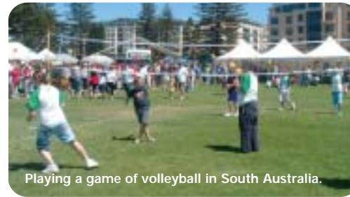
Playing a game of volleyball in South Australia.