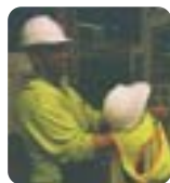
Date: 18.8.2004 Place: Linwood Quarry, SA

Following on from the transport safety meeting I was fortunate to meet all of the quarry workers in action and learnt all about safe "isolation and tag out" procedures at the crushing plant and this is evident by my photo placing an isolation tag and lock on the fired plat.