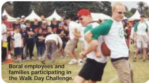
Boral employees and families participating in the Walk Day Challenge.