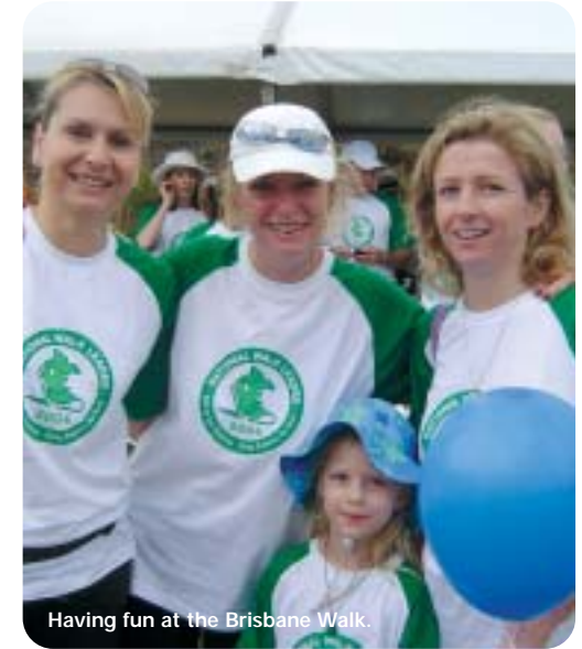
Having fun at the Brisbane Walk.