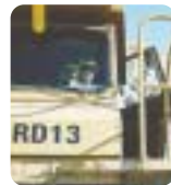
Date: 9.8.2004 Place: Orange Grove Quarry, WA

Oh boy, what an exciting day! After my safety induction, I got dressed up in all my PPE and went all around the quarry site. I got to go on a dump truck, to the plant room, to the weighbridge and then had morning tea with the workshop boys! Even though they act all tough, I got plenty of cuddles everywhere I went.