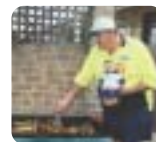
Date: 10.9.2004 Place: Darwin Concrete, WA