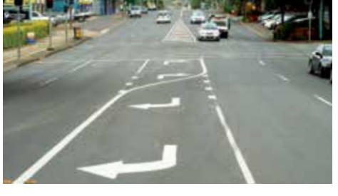
Durapave on Stafford Road, Gordon Park, QLD