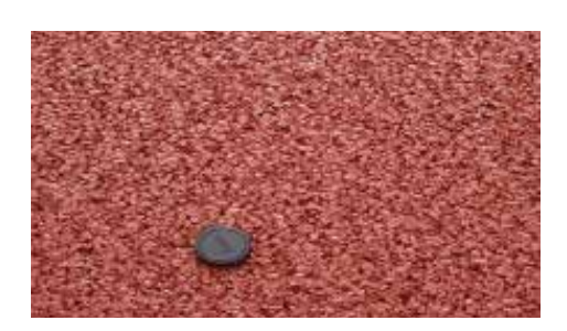
Coloured Durapave on bus lanes